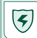
Expert Technical Support